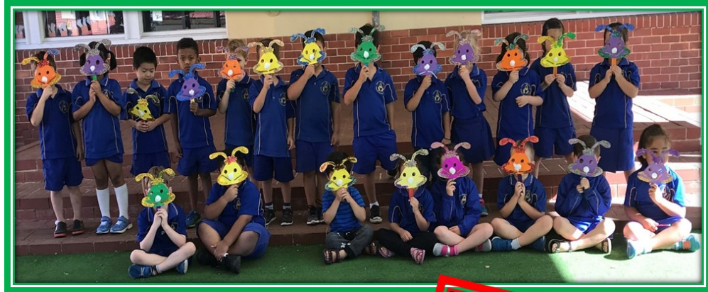
We had so much fun making masks for the Easter Parade.