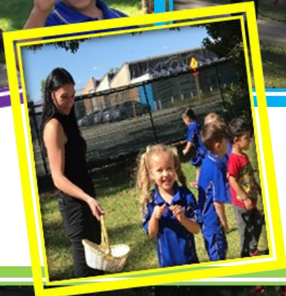
We went on an Easter egg hunt and found lots of chocolate eggs from the Easter Bunny.