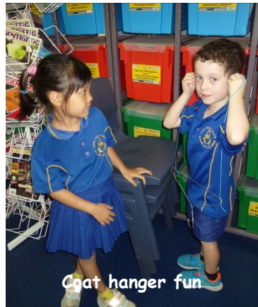
Coat hanger fun