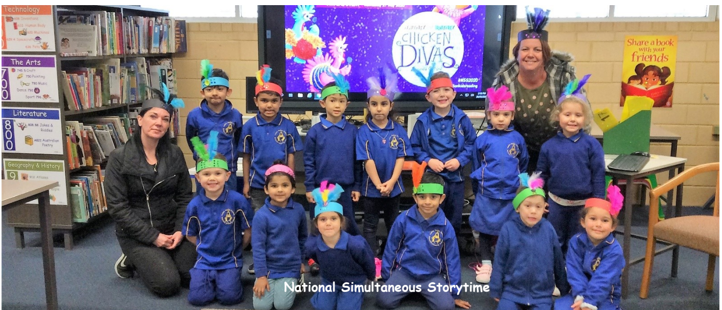
National Simultaneous Storytime