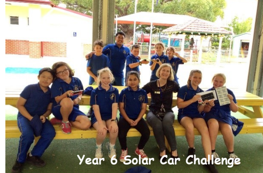
Year 6 Solar Car Challenge