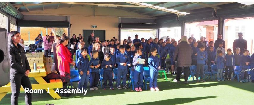
Room 1 Assembly