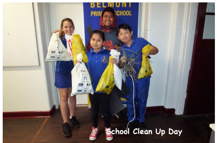
School Clean Up Day