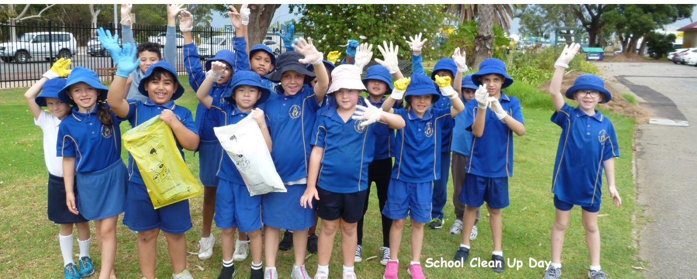
School Clean Up Day