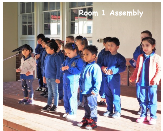
Room 1 Assembly