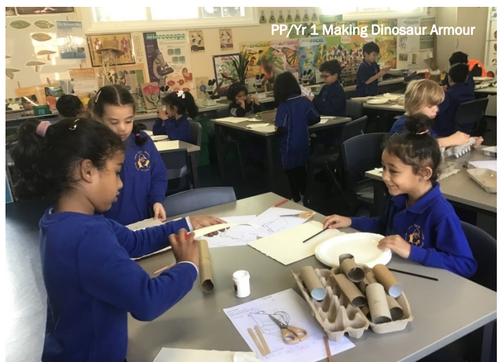
PP/Yr 1 Making Dinosaur Armour