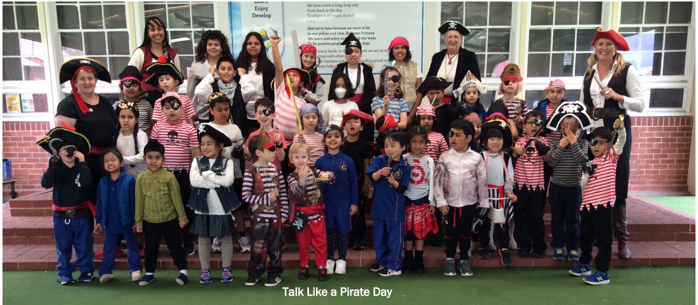
Talk Like a Pirate Day