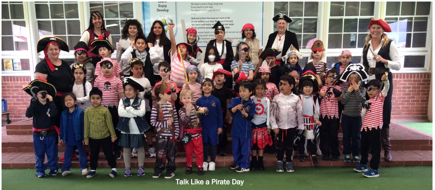
Talk Like a Pirate Day