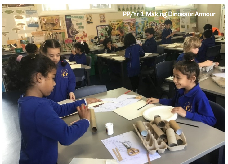
PP/Yr 1 Making Dinosaur Armour